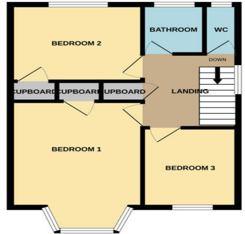
3 BEDROOM SEMI

Whilst every attempt has been made to ensure the accuracy of the floorplan contained here, measurements of doors, windows, rooms and any other items are approximate and no responsibility is taken for any error, omission or mis-statement. This plan is for illustrative purposes only and should be used as such by any prospective purchaser. The services, systems and appliances shown have not been tested and no guarantee as to their operability or efficiency can be given. Made with Metropix ©2026