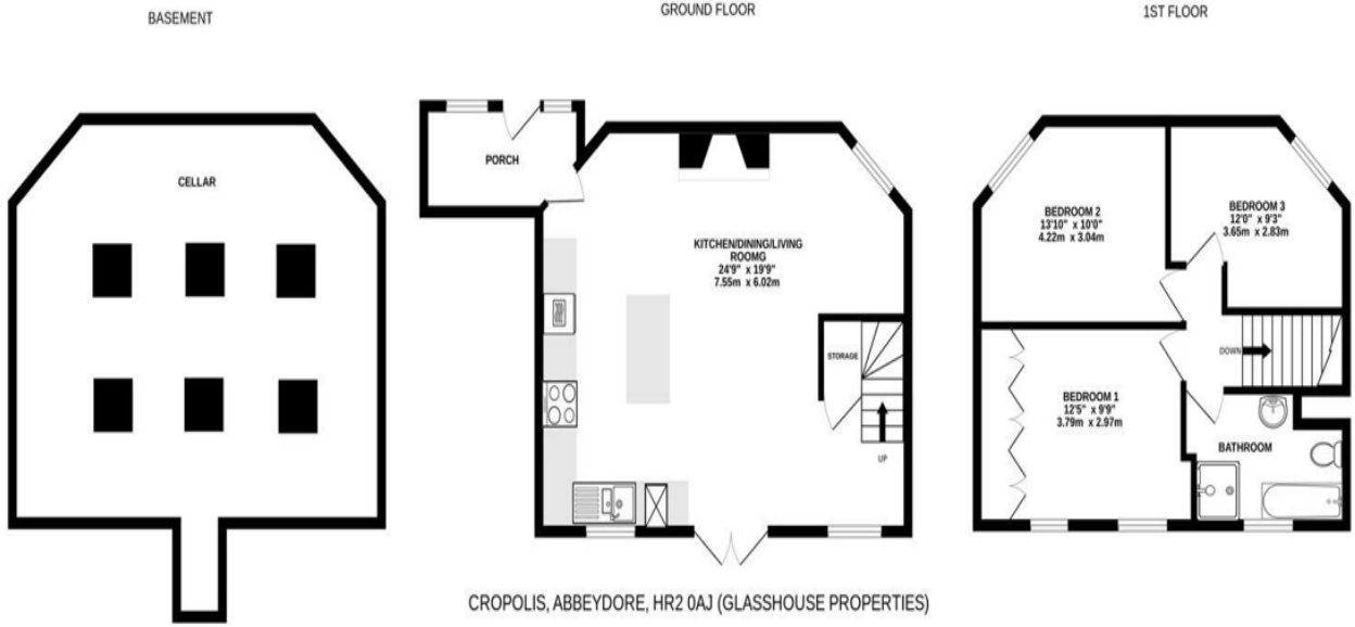
CROPOLIS, ABBEYDORE, HR2 0AJ (GLASSHOUSE PROPERTIES)

TOTAL FLOOR AREA : 1415 sq.ft. (131.5 sq.m.) approx.