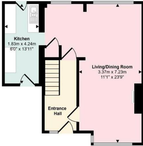
Ground Floor Approx 46 sq m / 492 sq ft

Approx Gross Internal Area 91 sq m / 982 sq ft