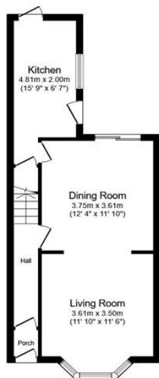
Ground Floor Floor area 42.4 sq.m. (456 sq.ft.)