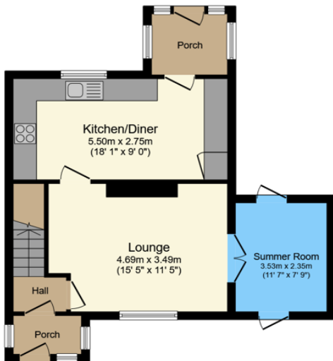
Ground Floor Floor area 47.9 sq.m. (516 sq.ft.)