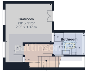
Landing 5'10" x 1'0" 1.80 x 0.31 m