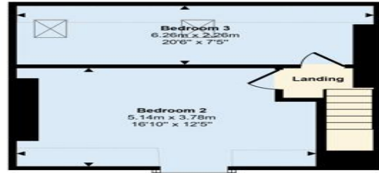
First Floor Approx 81 sq m / 869 sq ft