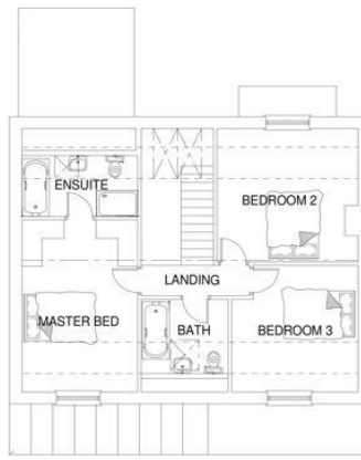
PROPOSED FIRST FLOOR PLAN (scale 1:100@A3)