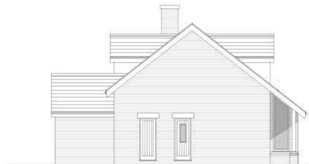
PROPOSED SOUTH EAST ELEVATION (scale 1:100@A3)