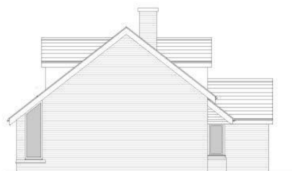
PROPOSED NORTH WEST ELEVATION (scale 1:100@A3)