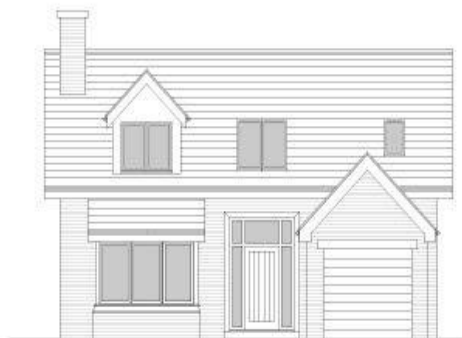
PROPOSED SOUTH WEST ELEVATION (scale 1:100@A3)