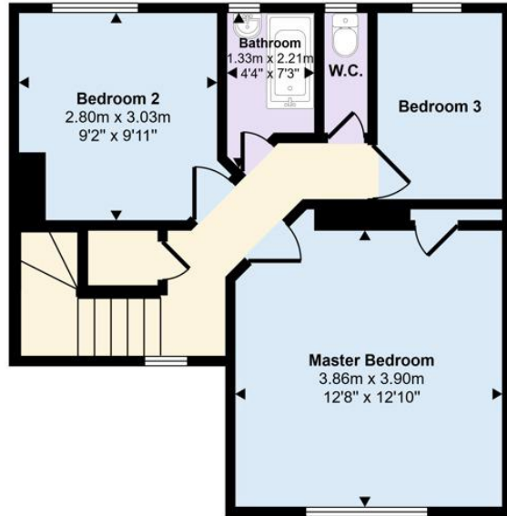
First Floor Approx 43 sq m / 459 sq ft

This floorplan is only for illustrative purposes and is not to scale. Measurements of rooms, doors, windows, and any items are approximate and no responsibility is taken for any error, omission or mis-statement. Icons of items such as bathroom suites are representations only and may not look like the real items. Made with Made Snappy 360.